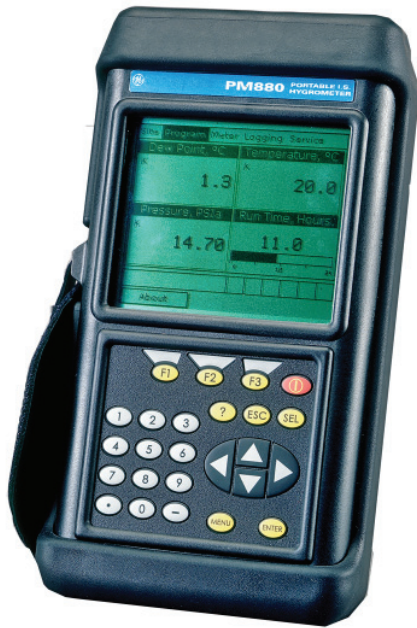
The PM880's large LCD displays moisture readings in dew point (°C or °F), ppm v , ppm w , lb/MMSCF (natural gas) and a variety of other unit options in graphic or alphanumeric formats.

Training for the PM880 is available on-site, in the factory or online. GE offers extended warranties and service agreements for the PM880 as well as a range of services including NIST-traceable calibration, field calibration, rentals and moisture surveys.